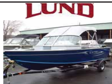
New 1650 Renegade Sport With Mercury F50 EFI

or $149 per month $0 down 7.9% 60 mos. OAC