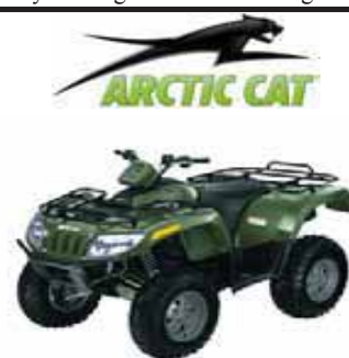
New 550cc EFI 4x4 Automatic