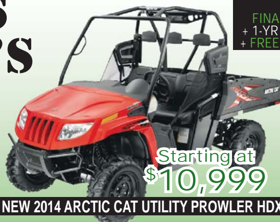
Starting at $10,999 NEW 2014 ARCTIC CAT UTILITY PROWLER HDX