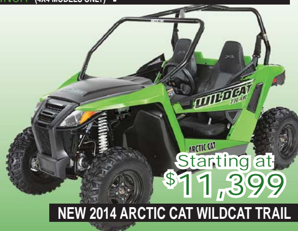
Starting at $11,399 NEW 2014 ARCTIC CAT WILDCAT TRAIL