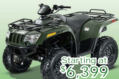
Starting at $6,399 NEW 2014 ARCTIC CAT 500 RECREATION